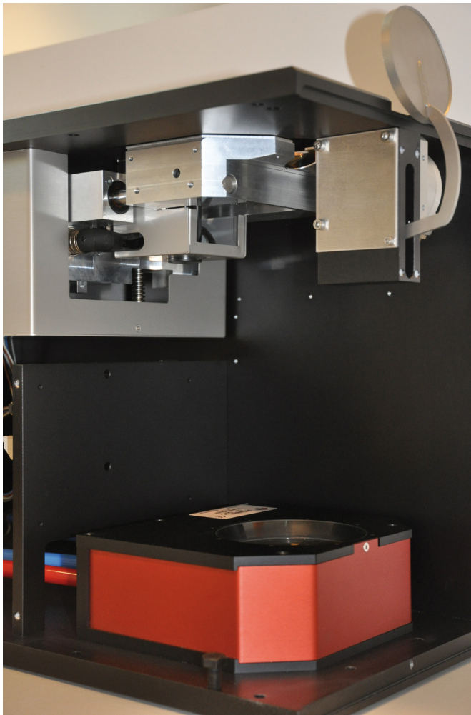
Interior view of the BeamControlSystem: Top, FocusMonitor; bottom, CompactPowerMonitor